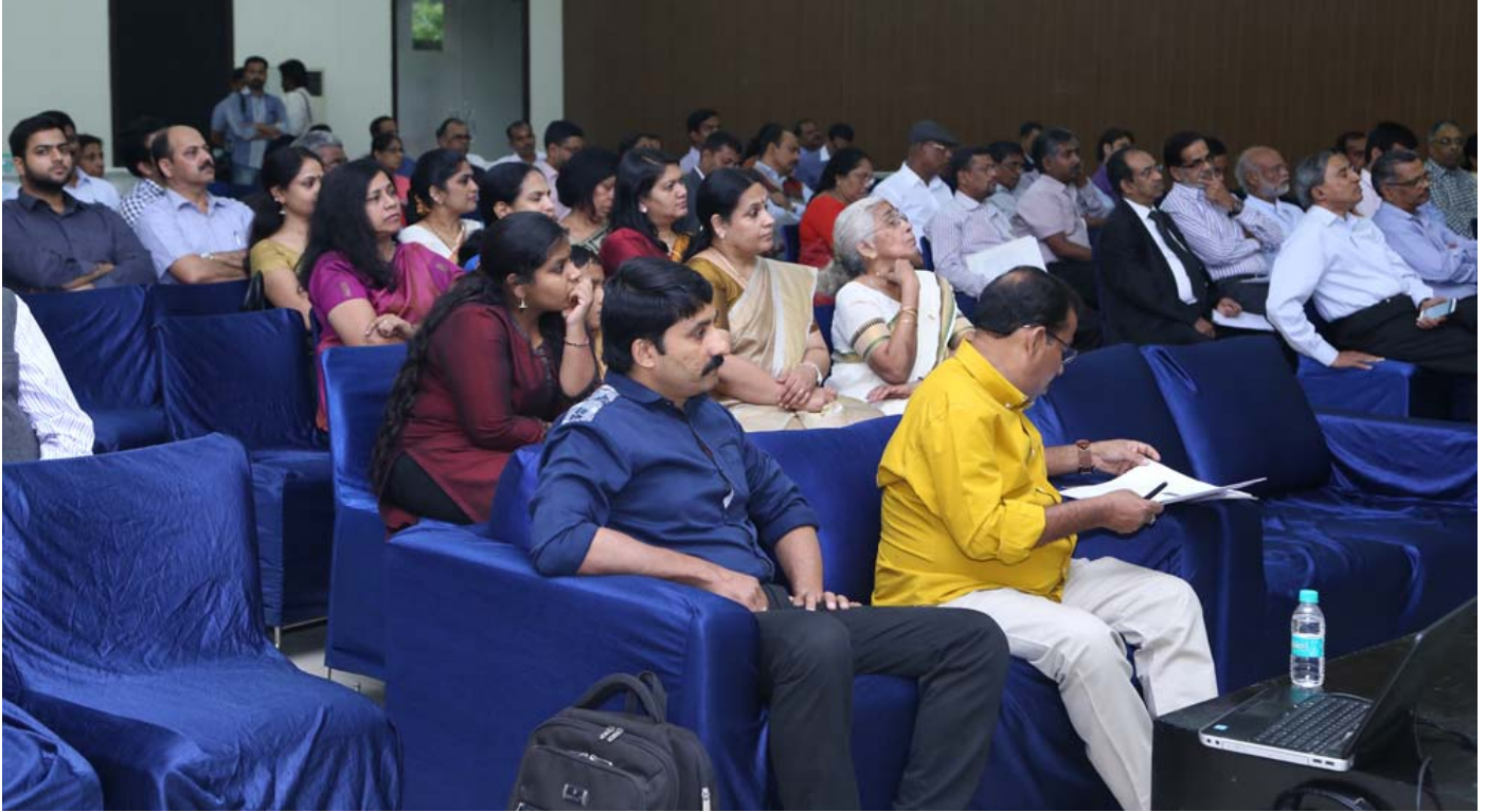
A view from participants

Case studies of five entrepreneurs were presented and discussed threadbare. Speakers pointed out that some of them have started their career as low level employees and they started their own enterprise with a humble beginning, and gradually set up enterprise with their determination, commitment and hard work. In line with the findings of the case studies the speakers narrated the essential features of NRK enterprises in the NCR of Delhi. NRK entrepreneurship in Delhi was, by and large, an individual initiative and there was no family experience. They started business on their own by making use of opportunities and experiences in the professional field. Education is not an essential feature for a successful entrepreneurship, though education can strengthen it. Most of the NRK entrepreneurs have trained their sons or daughters in the same line of business to continue the business operations.