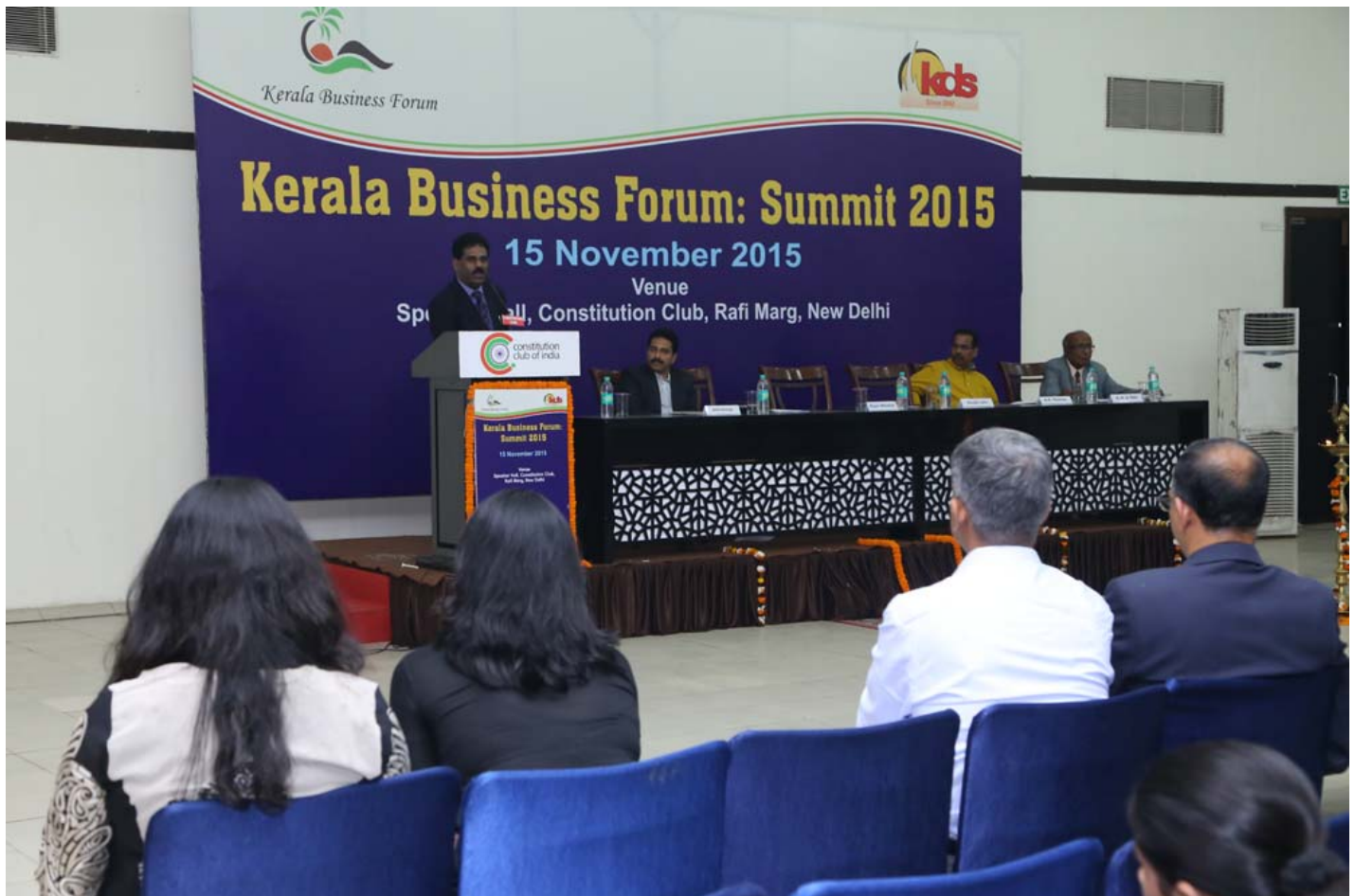
Session on 'New Modes of MSME Financing' is in progress