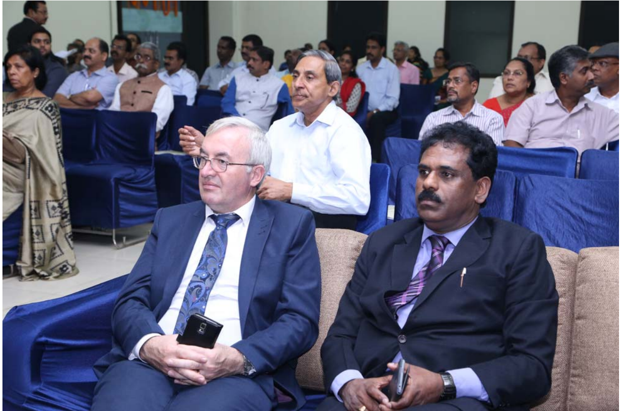
A view from participants