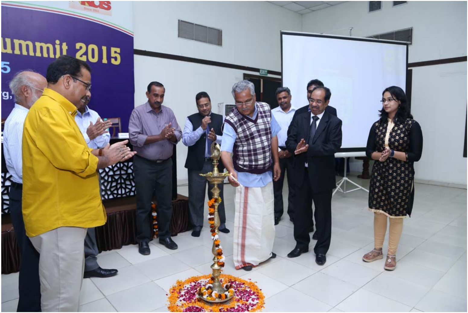
Shri. Binoy Viswam, Lighting the lamp