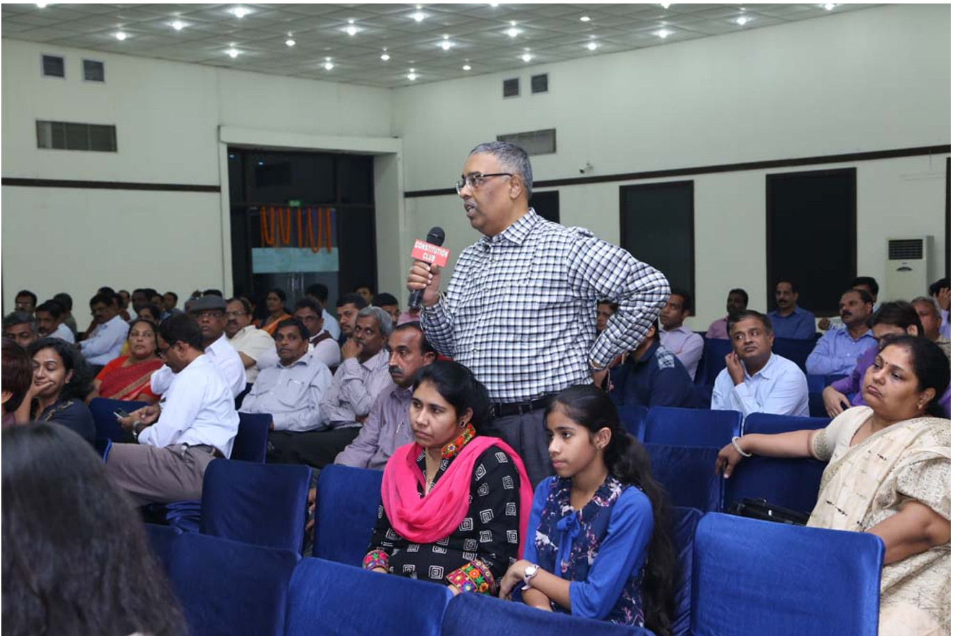
A view from Open House discussion

venture and difficulties in the retention of employees in the industry where the employee gets trained and experienced and then moves for career growth. Speakers laid out the tough challenges of doing business in India, particularly in Delhi. They emphasized the need for producing quality products without making environmental impact. Market research should be carried out to assess the demand of the product being produced. There is a need for being a “good employer” and help employees to feel valued. Moreover, entrepreneurs should follow the rules and regulations.