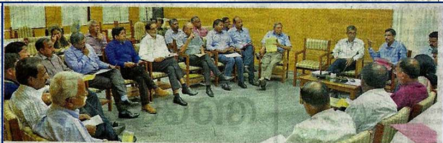
കേരള ബിസിനസ് ഫോറം സ്ഥാപക അംഗങ്ങളുടെ യോഗം.

ന്യൂഡൽഹി • കേരളത്തിലെ അഭ്യസ്തവിദ്യരായ സമൂഹത്തിന് നിലവാരമുള്ള തൊഴിലവസരങ്ങൾ ലഭ്യമാക്കണമെന്ന് മുൻ ധനമന്ത്രി തോമസ് ഐസക്. കേരള ഡവലപ്മെന്റ് സൊസൈറ്റിയുടെ (കെഡിഎസ്) നേതൃത്വത്തിൽ കോൺസ്റ്റിറ്റ്യൂഷൻ ക്ലബ്ബിൽ സംഘടിപ്പിച്ച കേരള ബിസിനസ് ഫോറം സമ്മേളനത്തിൽ സംസാരിക്കുകയായിരുന്നു അദ്ദേഹം. ഗുണനിലവാരമുള്ള തൊഴിൽ സൃഷ്ടിക്കുന്നതിനു വഴിയൊരുക്കുന്ന മുല്യാധിഷ്ഠിത വികസന പാതയിലേക്ക് സംസ്ഥാനം നീങ്ങണം.