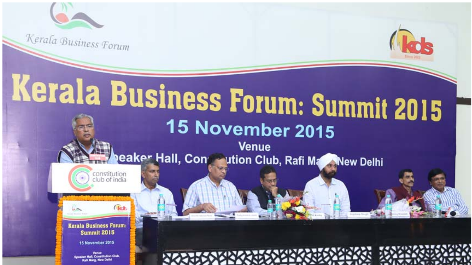
Shri. Binoy Viswam, addresses

Shri. Binoy Viswam, CPI leader and Former Forest Minister of Kerala inaugurated the KBF by lighting the lamp along with select successful Non- Resident Keralite entrepreneurs