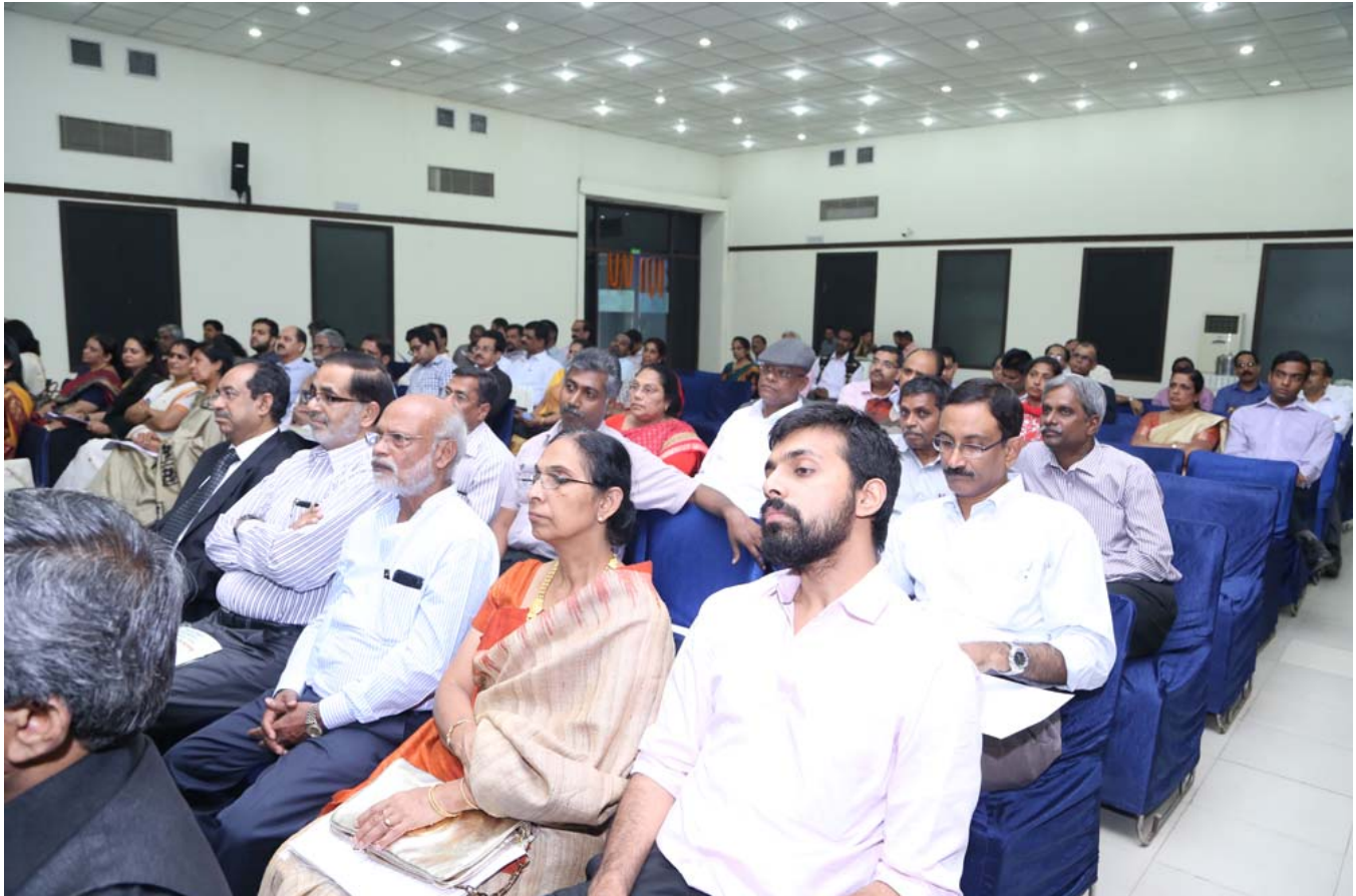
A view from participants

industrial buildings, all aspects of urban renewal, large-scale housing, land and site planning, and interior design in several parts of India. His practice has completed close to 1000 projects, with 30 underway and has been involved in the design and construction of the largest number of religious buildings in the world, a rare feat which has been applied for as a Guinness Book Record.