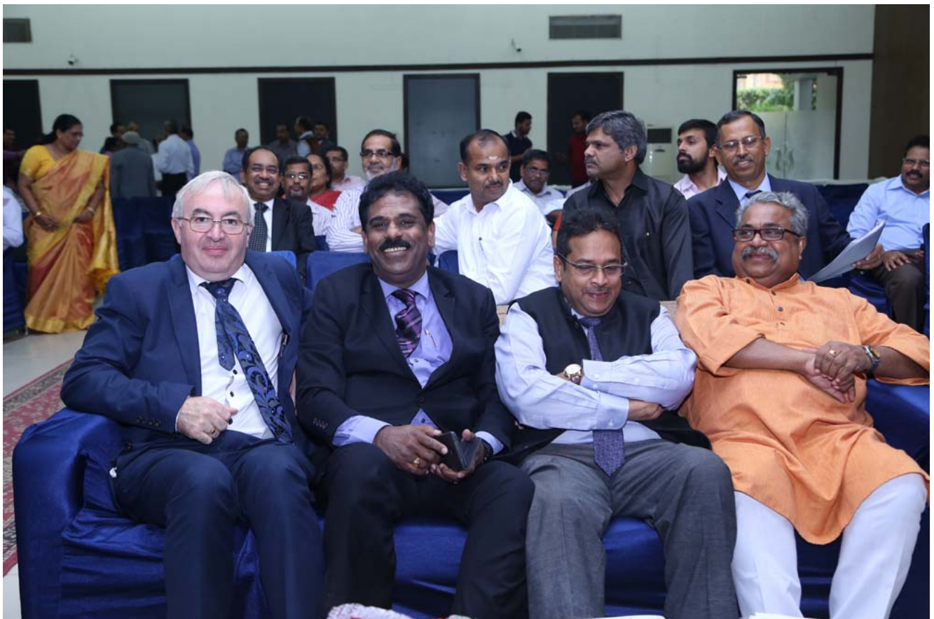
Delegates share views