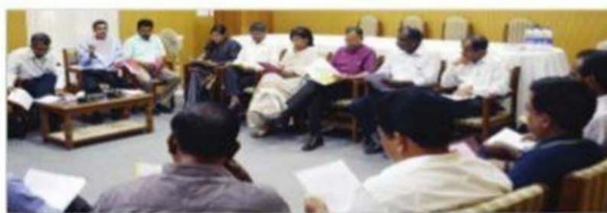
കേരള ബിസിനസ് ഫോറത്തിന്റെ യോഗത്തിൽ നിന്ന്