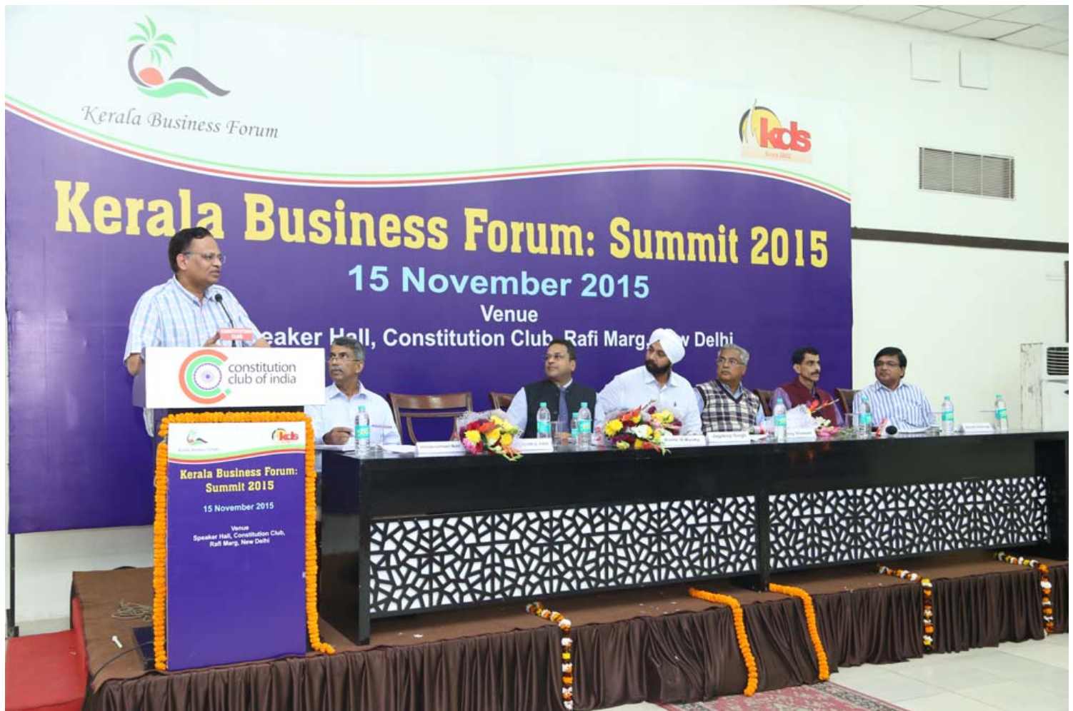
Shri. Satyendra Jain addresses

in creating a corrupt free environment for doing business. He said that India should encourage domestic direct investment instead of foreign direct investment. He also assured the delegates of a fast process of setting up of industries in Delhi, instead of dealing with several departments at present, so that industries from Kerala, Tamil Nadu and West Bengal would feel assured to set up business in Delhi. He said that the registration system will be made online to make it corruption free and transparent.