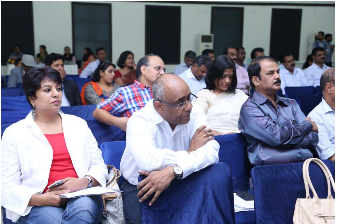
A view from participants

products from India. The Buying House, India Merchandising Services in Noida had successfully overcome micro and macro level challenges right from identifying the correct manufacturer; ensuring the product is manufactured as per demanded quality and specifications, fixing the problems during production level, getting it made within the stipulated time, ensuring the merchandise is shipped within the delivery window, getting the payment to the exporter from the buyer, etc. After he made this significant achievement in Delhi he has now ventured into the hospitality industry by setting up a hotel in Alapuzha in Kerala.