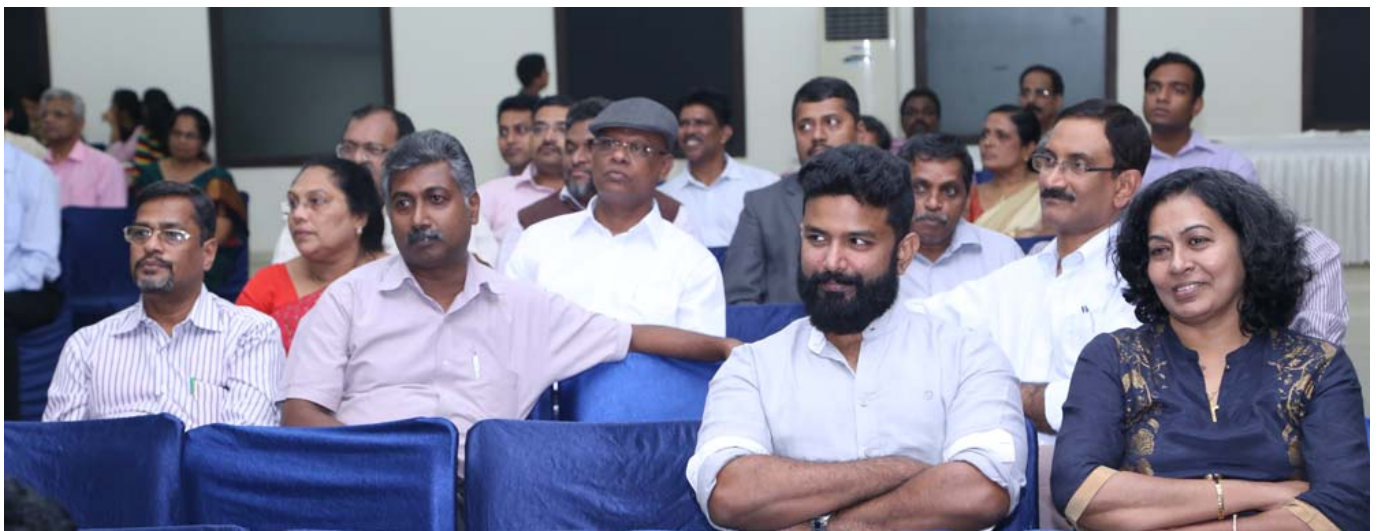
A view from participants

The speakers were unanimous in raising the major problems of NRK enterprises in Delhi. Lack of communication skill and confidence, an outsider feeling of NRK enterprises in Delhi, lack of educational qualification for setting up of and management of business